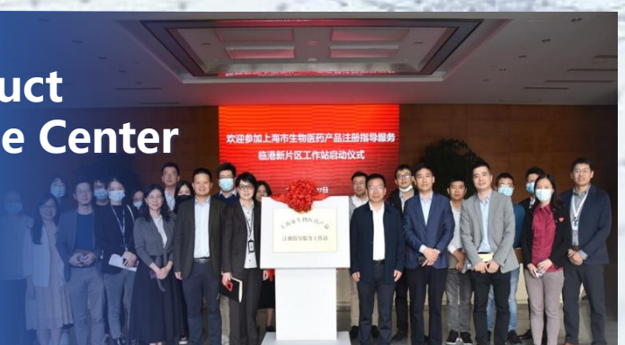
Bio-medicine Product Registration Service Center