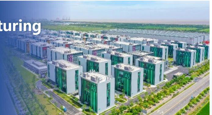
R&D and Manufacturing Facility