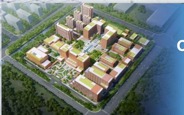
Shanghai Institute of Organic Chemistry, CAS

Cooperated by LINGANG Group and Huashan Hospital