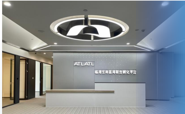
Life Science Incubator