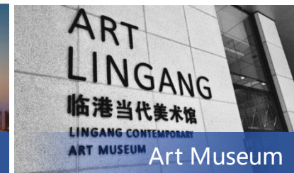
ART LINGANG 临港当代美术馆 LINGANG CONTEMPORARY ART MUSEUM Art Museum